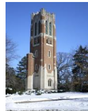
John W. Beaumont Memorial Tower